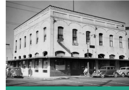
Finance Factors 1950s