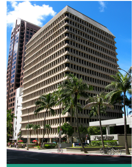
Finance Factors 2022